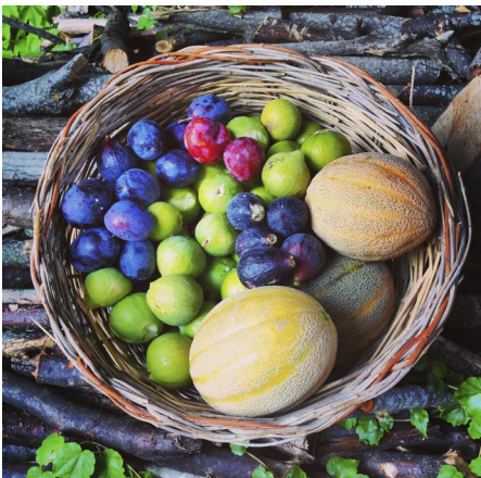
Bountiful. Blessed. Balance.

Mailing Address: N4695 CTY BB, Chilton Town Office: 920-849-4720